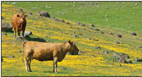
Cattle eat invasive grasses on one area of Coyote Ridge, before being moved on to another.

Were it not for the cows, Weiss says, these exquisite, ephemeral creatures could easily be the last of their kind.